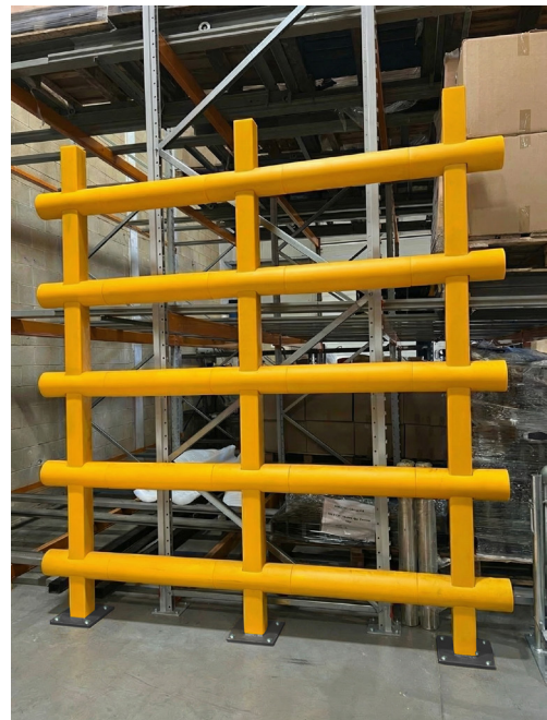
Safety Yellow and Grey

Brandsafe® The Anti-Topple Barrier is designed for high level storage zones where stacked pallets, totes or lightweight loads risk becoming unstable. It provides a strong vertical safety line for areas exposed to air movement, frequent stock rotation or busy forklift activity. Ideal for racking ends, mezzanine edges and bulk storage lanes, the system helps prevent items from toppling into pedestrian routes or vehicle aisles. Suitable for warehouses, manufacturing sites and distribution centres looking to enhance safety, reduce incidents and maintain compliant, well organised operations.